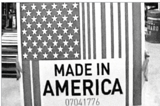
ABC News "Made In America" piece