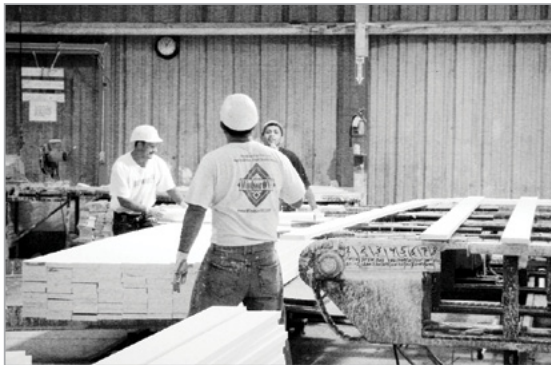
Guys on the line at the California mill